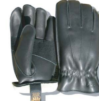
G-6B "Winter Model inner BOA"

Color / SWANY YELLOW Quality / COW LEATHER (waterproof) . KEVLAR (Made in USA) ACRYL 100% (Inner BOA) Size / M . L Price / 12,600yen (TAX in) Usage / GENERAL OUTDOORS