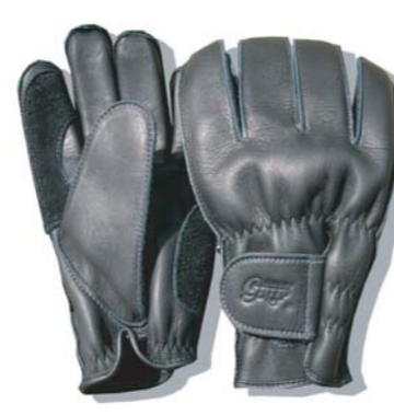
G-3B "Short Type"

Color / BLACK Quality / COW LEATHER (waterproof) . KEVLAR (Made in USA) Size / M . L Price / 9,450yen (TAX in) Usage / DEDICATED RIDER