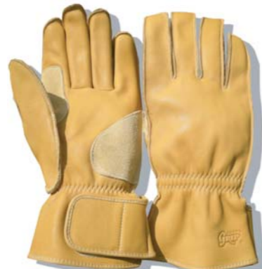
G-2 "Long Type"

Color / SWANY YELLOW Quality / COW LEATHER (waterproof) . KEVLAR (Made in USA) Size / S . M . L . XL Price / 7,350yen (TAX in) Usage / GENERAL OUTDOORS