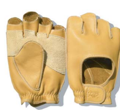
G-12 "Driving Type"

Color / BLACK Quality / COW LEATHER (waterproof) . KEVLAR (Made in USA) Size / M . L Price / 8,925yen (TAX in) Usage / Climbing Belay