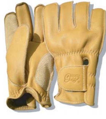
G-3 "Short Type"

Color / SWANY YELLOW Quality / COW LEATHER (waterproof) . KEVLAR (Made in USA) Size / S . M . L . XL Price / 9,450yen (TAX in) Usage / DEDICATED RIDER