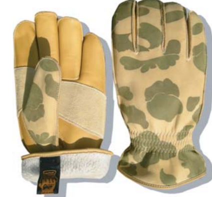
G-7 "Hunting Model inner BOA"

Color / BLACK Quality / COW LEATHER (waterproof) . KEVLAR (Made in USA) ACRYL 100% (Inner BOA) Size / M . L Price / 12,600yen (TAX in) Usage / GENERAL OUTDOORS