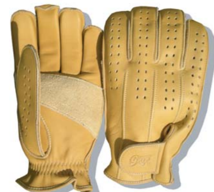
G-4 "Punching Model"

Color / ORIGINAL HUNTING-CAMO Quality / COW LEATHER . KEVLAR (Made in USA) ACRYL 100% (Inner BOA) Size / M . L Price / 12,600yen (TAX in) Usage / HUNTING OUTDOORS