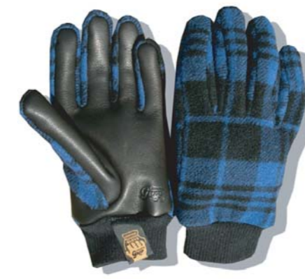
G-5BLUE "Buffalo-Check inner BOA"

Color / RED-CHEK Quality / COW LEATHER (waterproof) . KEVLAR (Made in USA) WOOL 80% - POLYESTER 20% (Buffalo check) ACRYL 100% (Inner BOA) Size / FREE Price / 9,975yen (TAX in) Usage / GENERAL OUTDOORS