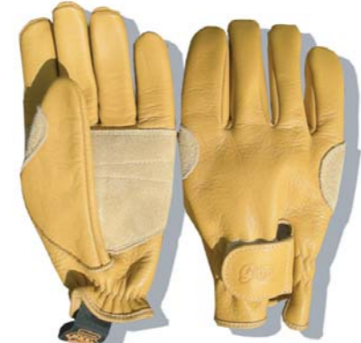
G-10 "Belay Model"

Color / SWANY YELLOW Quality / COW LEATHER (waterproof) . KEVLAR (Made in USA) Size / M . L Price / 8,925yen (TAX in) Usage / GENERAL OUTDOORS