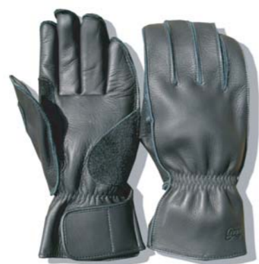
G-2B "Long Type"

Color / BLACK Quality / COW LEATHER (waterproof) . KEVLAR (Made in USA) Size / M . L Price / 7,350yen (TAX in) Usage / GENERAL OUTDOORS