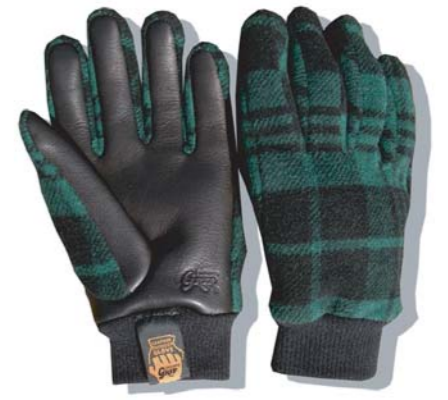
G-5GREEN "Buffalo-Check inner BOA"

Color / BLUE-CHEK Quality / COW LEATHER (waterproof) . KEVLAR (Made in USA) WOOL 80% - POLYESTER 20% (Buffalo check) ACRYL 100% (Inner BOA) Size / FREE Price / 9,975yen (TAX in) Usage / GENERAL OUTDOORS