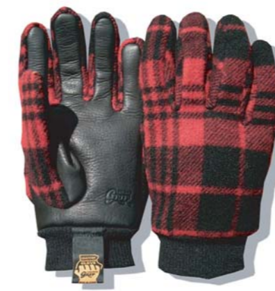
G-5 "Buffalo-Check inner BOA"

Color / SWANY YELLOW Quality / COW LEATHER (waterproof) . KEVLAR (Made in USA) Size / S . M . L . XL Price / 8,400yen (TAX in) Usage / GENERAL OUTDOORS