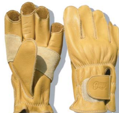
G-11 "Climbing Type"

Color / SWANY YELLOW Quality / COW LEATHER (waterproof) . KEVLAR (Made in USA) Size / M . L Price / 8,925yen (TAX in) Usage / Climbing Belay