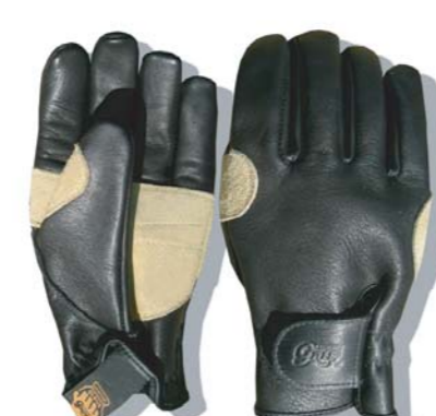
G-10B "Belay Model"

Color / BLACK Quality / COW LEATHER (waterproof) . KEVLAR (Made in USA) Size / M . L Price / 8,925yen (TAX in) Usage / GENERAL OUTDOORS