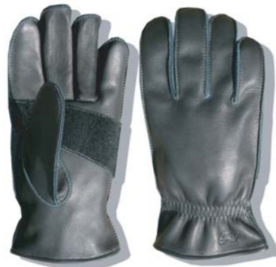
G-1B "Regular Type"

Color / GREEN-CHEK Quality / COW LEATHER (waterproof) . KEVLAR (Made in USA) WOOL 80% - POLYESTER 20% (Buffalo check) ACRYL 100% (Inner BOA) Size / FREE Price / 9,975yen (TAX in) Usage / GENERAL OUTDOORS