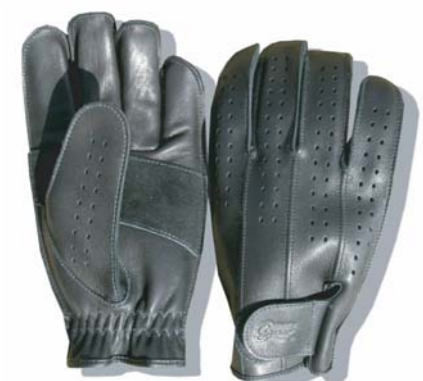
G-4B "Punching Model"

Color / SWANY YELLOW Quality / COW LEATHER (waterproof) . KEVLAR (Made in USA) Size / M . L Price / 7,350yen (TAX in) Usage / Rose only glider