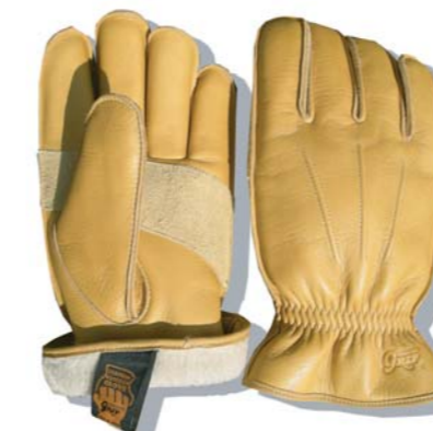
G-6 "Winter Model inner BOA"

Color / BLACK Quality / COW LEATHER (waterproof) . KEVLAR (Made in USA) Size / M . L Price / 8,400yen (TAX in) Usage / GENERAL OUTDOORS