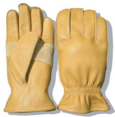
G-1 "Regular Type"

Color / SWANY YELLOW Quality / COW LEATHER (waterproof) . KEVLAR (Made in USA) Size / S . M . L . XL Price / 7,350yen (TAX in) Usage / GENERAL OUTDOORS